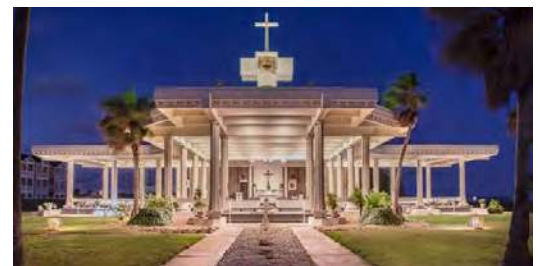
St. Andrew by the Sea Catholic Church

Today, the city is home to 305,000 people and home to the Diocese of Corpus Christi. It is also home to St. Andrew by the Sea Catholic Church. Located on North Padre Island, it is the only parish in the world where Mass is celebrated outdoors year-round. It is also likely the only church where mosquito repellent sits next to the Holy Water fonts.