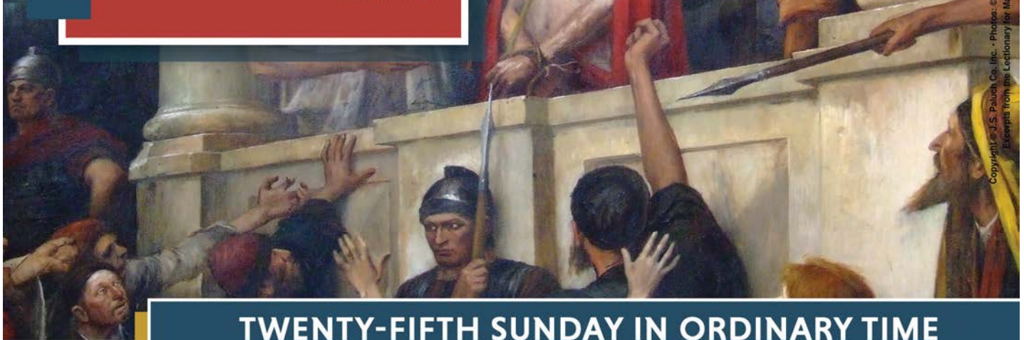
Copyright © J.S. Paluch Co. Inc. - Photos: © PD-Wikimedia. Ecce Homo! by Mihály Munkácsy Excerpt from the Lectionary for Mass © 2001, 1998, 1997, 1986, 1970, CCD.