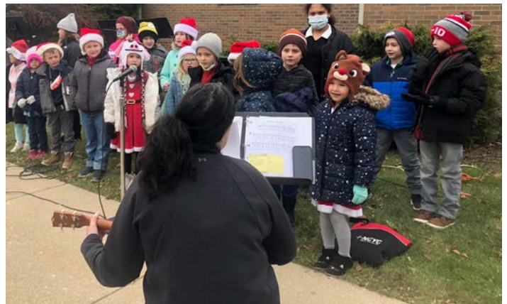
Elementary students sang carols while Santa and his elves helped to load vehicles with lots of sweet treats.