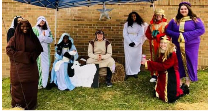
Spiritual Life students created a living nativity scene.

It was great to see some new and younger faces! Everyone did a fabulous job! Below are pictures from Sunday's event.